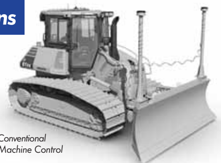
Conventional Machine Control