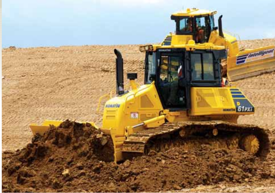
Komatsu introduced its new D61i-23 intelligent Machine Control dozers with integrated grade-control technology that provides automated blade control from rough-cut to finish grading. According to Komatsu's Ed Powers, the machines have received rave reviews.

The rental market has always been a good opportunity for growth. That's even more apparent now, as the Construction Equipment (CE) market recovers from one of the worst economic downturns since the Great Depression.