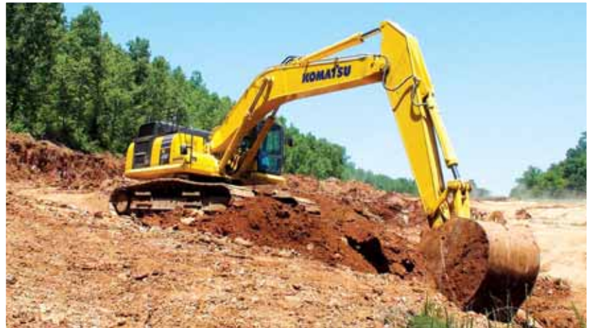
Komatsu met emissions regulations with its Tier 4 Interim machines, as well as improved productivity and efficiency that resulted in lower owning and operating costs. Tier 4 Final standards begin in earnest next year.

Typically the rental market has represented approximately 20 percent of our entire CE demand, but it's currently at nearly 45 percent, and we expect it to remain a dominant segment of our business. Through our Rental and ReMarketing Division, Komatsu and our Distributors are ready to enhance and reinforce our rental presence in the growing market.